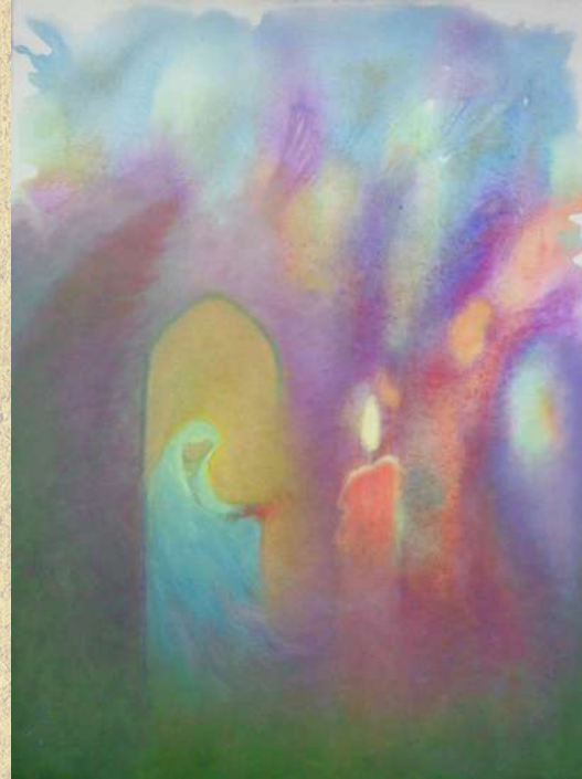
Light of Hope 80x60cm - Oil Color and Acrylic