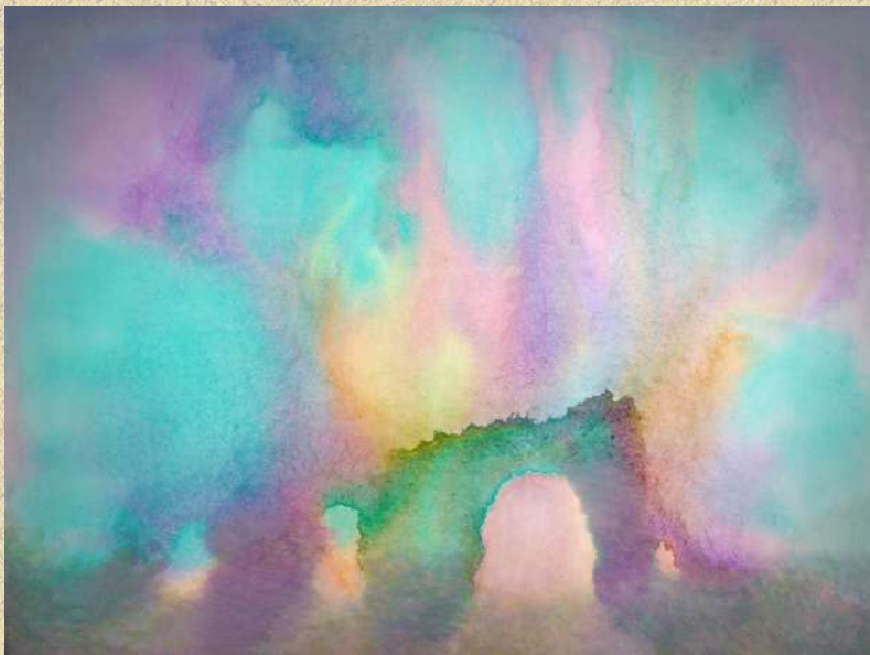
Earth and Heaven 60x80cm - Acrylic