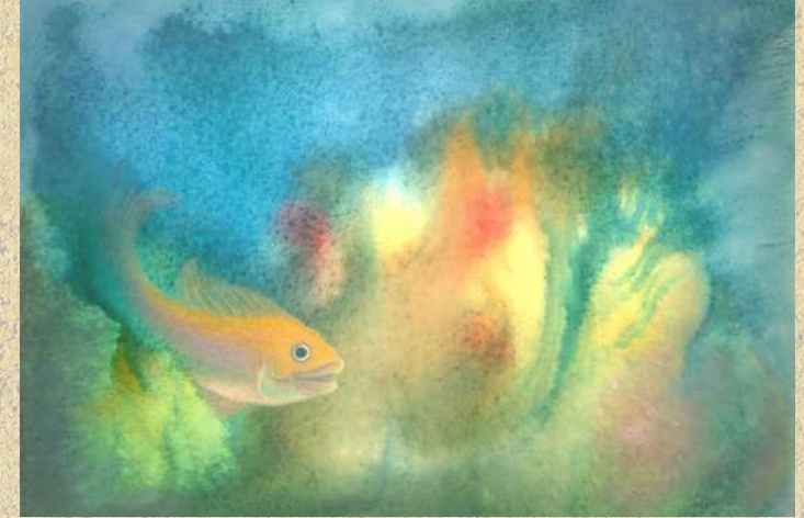
Goldfish 60x80cm - Oil Color and Acrylic